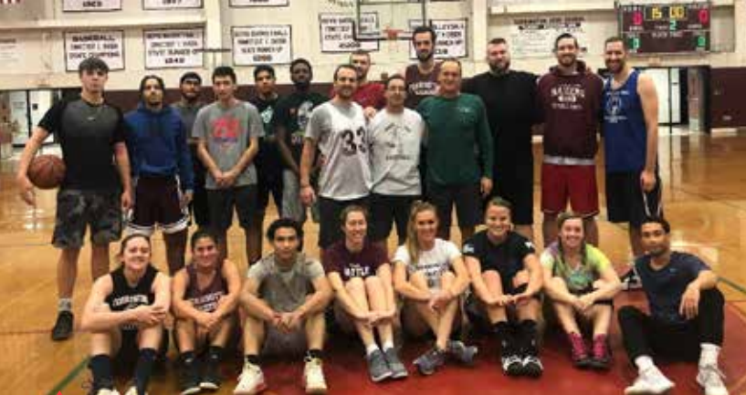
▲ VAC Basketball the day after Thanksgiving