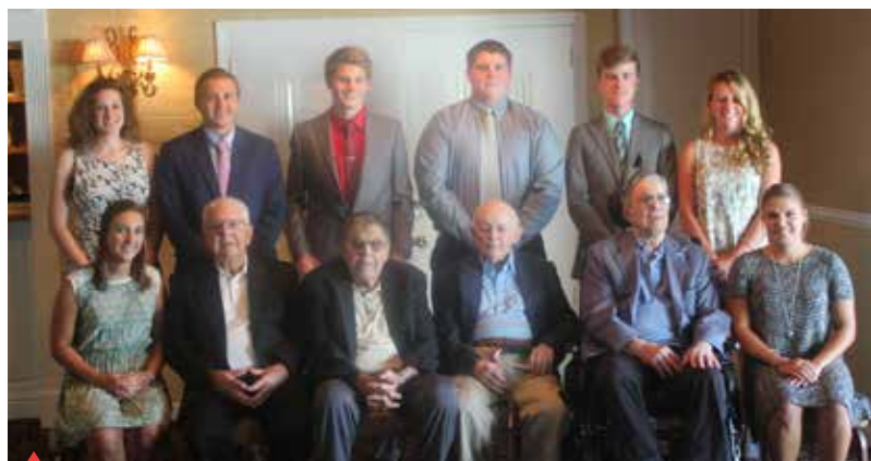
▲ The VAC has been supporting student athletes since 1945

Most are aware of the Varsity Alumni Club through the annual scholarships which are awarded each year to six to eight deserving THS student athletes. The first Varsity Alumni Scholarship was awarded in 1948 in the amount of $100.00. Since that time over $365,000.00 has been awarded to graduating Seniors who have participated in sports at THS.