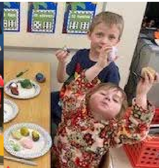
One of our clubs painted Kindness Rocks

Albreada REFUSE & SWEEPING LLC Locally Owned & Operated