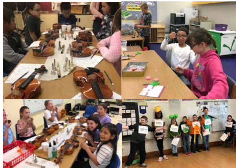
Left Top & Bottom: Grade 4 students getting introduced to our instruments.

Our study of American History in Social Studies has focused on colonial America. The students have learned about the history and everyday life of this time period. They have studied the New England colonies and the Middle colonies. They will soon be focusing on the Southern colonies.