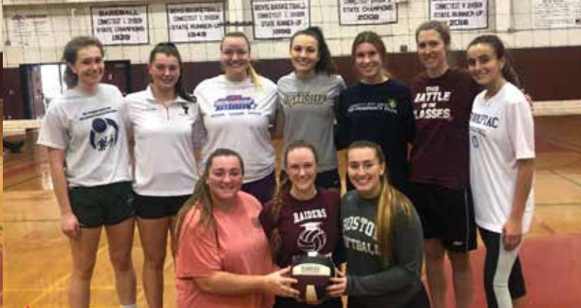
▲ VAC Volleyball, a family reunion