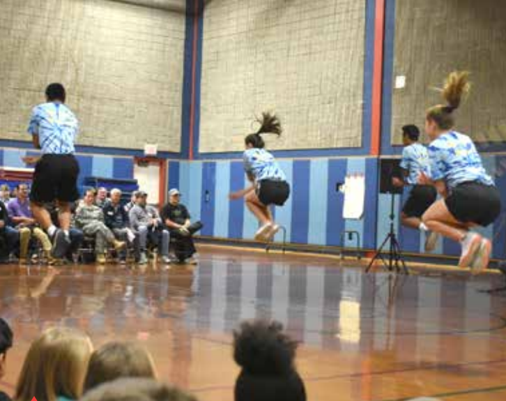
Forbes Flyers perform for Veterans