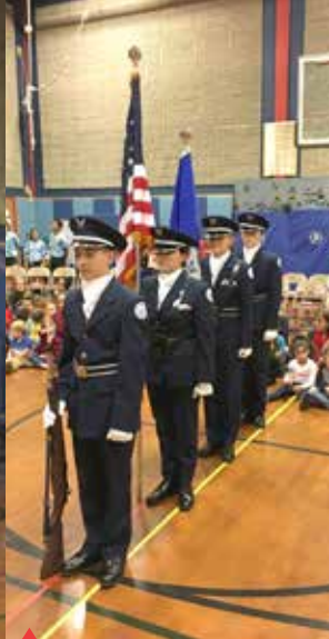
THS Color Guard