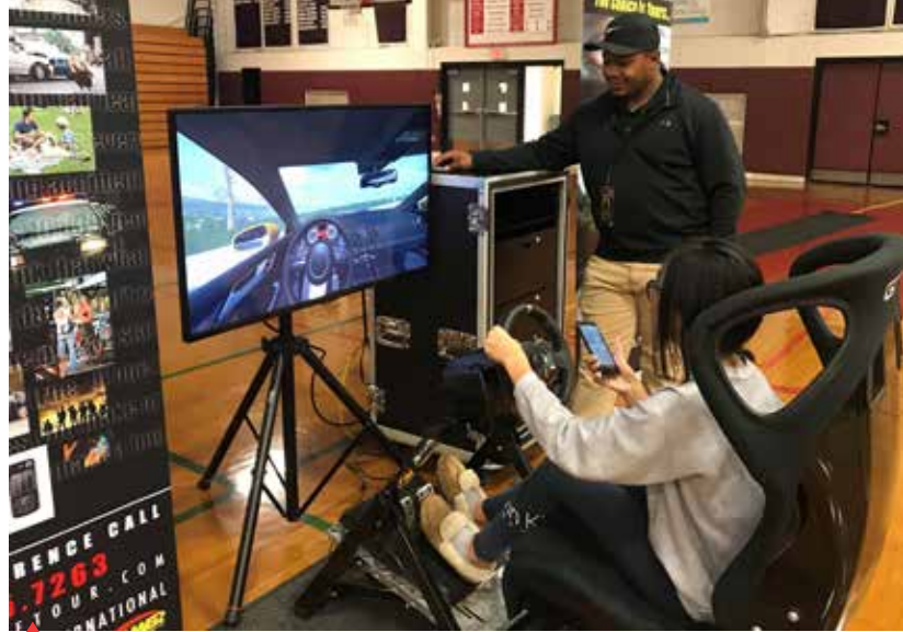
Distracted driving event in the Connie Donahue Gymnasium

We look forward to welcoming our next freshmen class and we will continue to strive for excellence at Torrington High School. We are incredibly proud of the dedication and achievements of our faculty and students. Thank you for believing in us and Torrington High School.