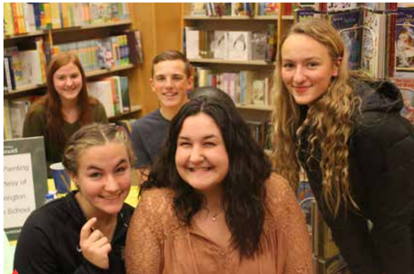
Barnes & Noble Book Drive