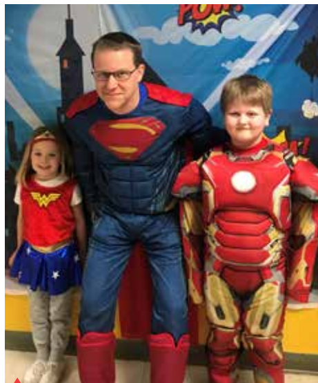
Vogel-Wetmore School became Gotham City for our Superhero Dance!