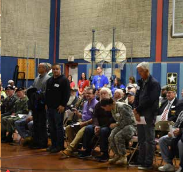
Veterans during the introduction ceremony

In both Humanities and STEM classes, students are learning how to support a claim. For example, in one Humanities class, students participated in a debate. The topic was “Should chocolate milk be allowed in schools?” Students had to choose a side, find evidence to support their claim, and then debate those from the opposing position. In STEM, students ran a number of tests on a variety of rocks. The goal was to figure out which rocks were meteorites. Once they completed the tests, they made a claim as to which rocks were meteorites and used evidence and reasoning to back up their claim. Being able to support an opinion with evidence and then to effectively present that argument is an essential skill for academic success as well as a lifelong skill -- in all career paths, and to be able to contribute to the community as an informed and responsible citizen.